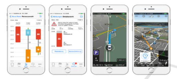
Figure 4: The MoveBW smartphone application provides functions for intermodal journey planning, traffic information, ticketing and on-trip navigation.

The MoveBW services are currently monitored and evaluated in an extensive trial phase. Based on the findings, both the digital service and traffic control strategies will be revised, aiming to maximize favored effects on the individual mobility behaviors of traffic participants, for example by applying different strategies for daily commuters and visitors. The smartphone application is planned to be released in the first quarter of 2019. Mock-ups of the current design are shown in Figure 4.